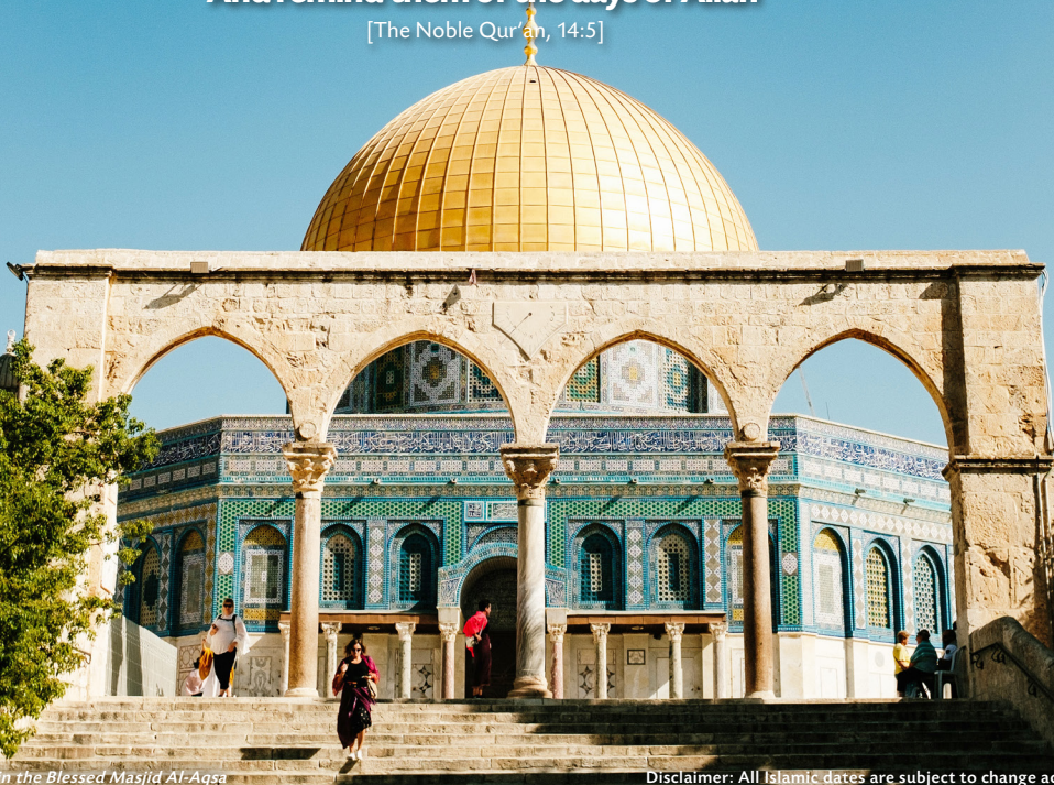
Pictured: Dome of the Rock Masjid in the Blessed Masjid Al-Aqsa

Disclaimer: All Islamic dates are subject to change according to moon sighting